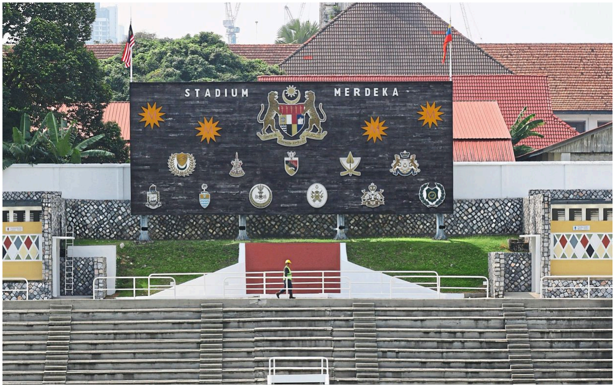
Good as new: The rebuilt display board located within the stadium.

According to PNB Merdeka Ventures Sdn Bhd Communications head Liza Karim, the restoration effort for the stadium – which began in 2017 and is now fully completed – was about returning the Merdeka Stadium to its original state.