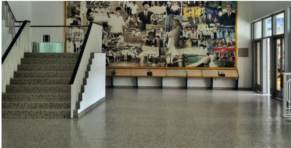
Stepping into the Past: The traditional floor tiles at Stadium Merdeka, meticulously restored to their original 1957 design, transport visitors to a bygone era of classic elegance and craftsmanship.

As Stadium Merdeka prepares to reopen, it is not just a celebration of the past but also a promise of a brighter future.