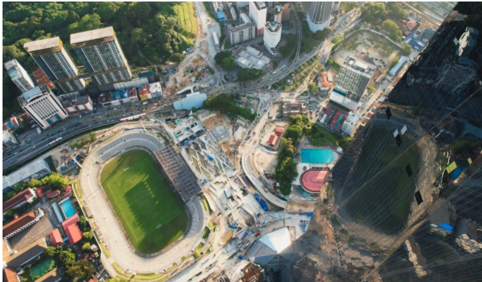
This is an aerial view of Stadium Merdeka, a beacon of Malaysia's past and future standing tall amidst the urban landscape of Kuala Lumpur.

Despite its immense historical significance, the stadium has largely been forgotten, overshadowed by the country's rapid development and modernization—however, all that is about to change.