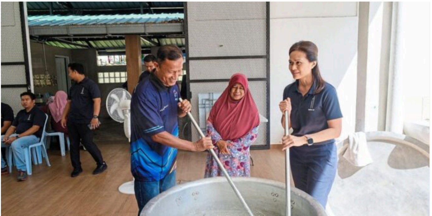
Sharing meals around Merdeka 118 to foster neighbourly ties