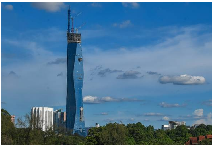
The RM5 billion Merdeka 118 development has 3.1 million square feet of floor space and the highest observation deck in Southeast Asia, standing 500 metres above the ground.

KUALA LUMPUR: The restoration of Merdeka Stadium, where the country's freedom was declared in 1957, and the adjoining grandiose development of Merdeka 118 Tower truly reflects how far the country has progressed as a nation.